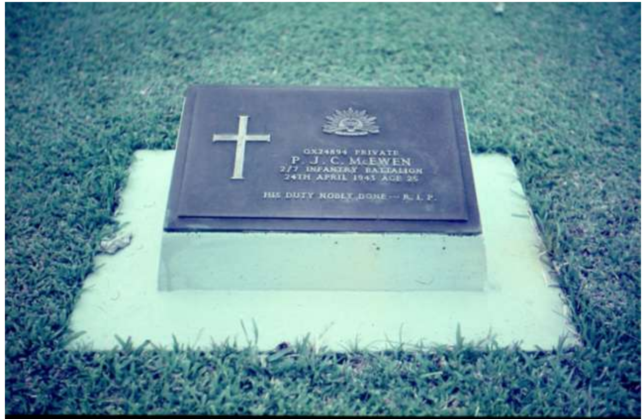
My father's friend