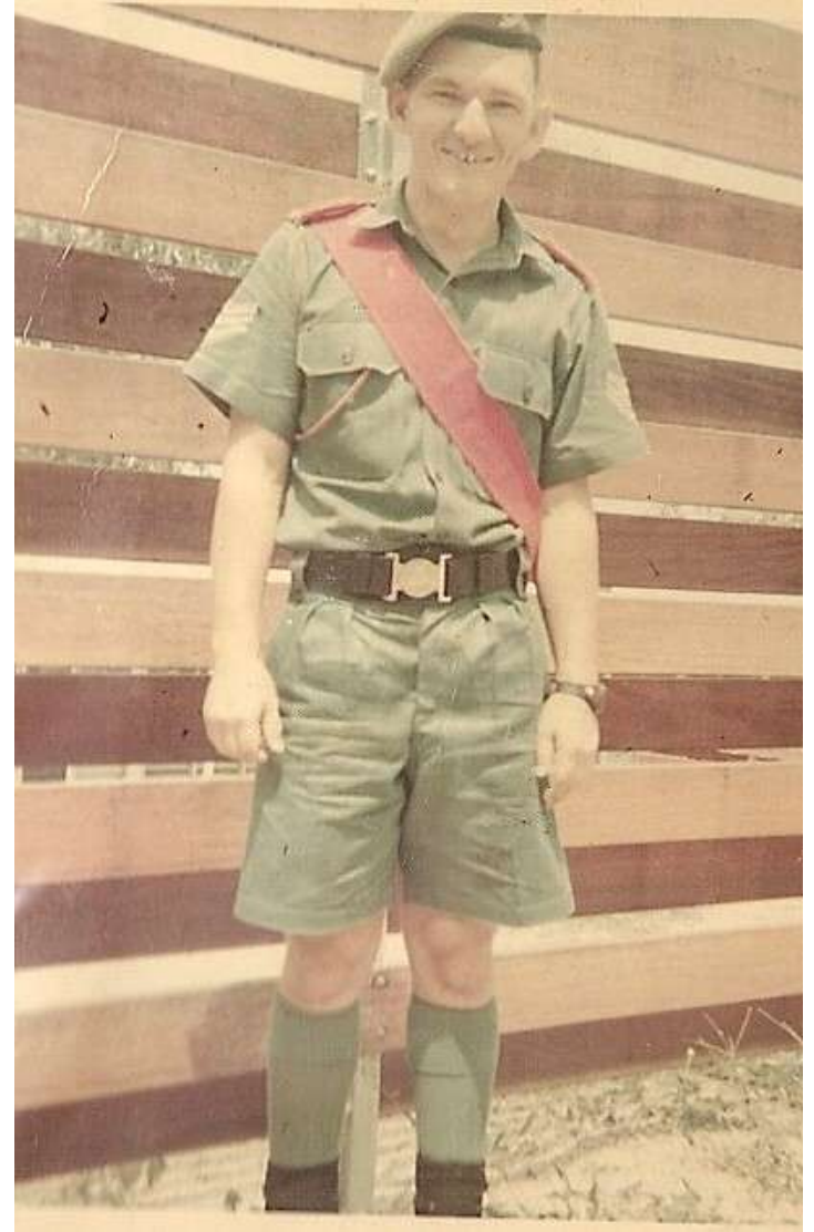
The First Chalkie