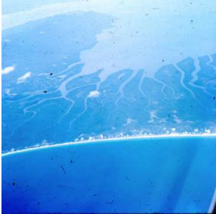
A village on a peninsula near Lae

Taking a trip on a locally organised excursion