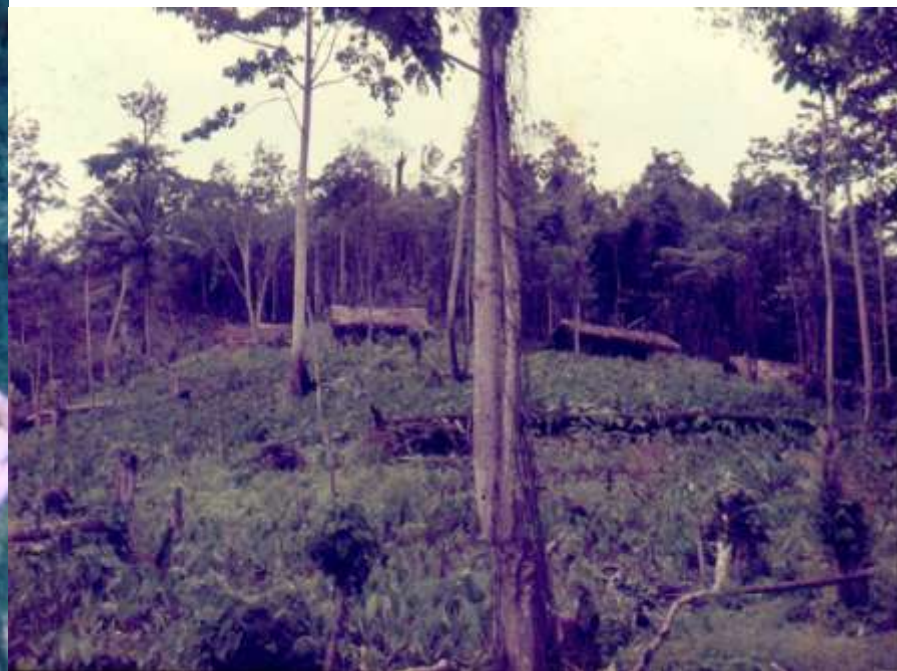
Village near the Markham River